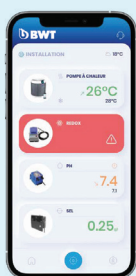
List of connected equipment